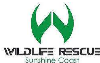
Sunshine Coast Wildlife Rescue