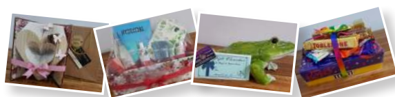
Mothers Day Raffle prizes