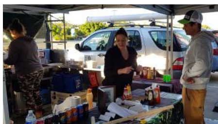
Hard at work