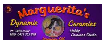
Marguerita's Dynamic Ceramics